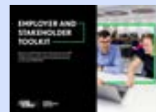
Employers and Stakeholders

Take a look at our tailored toolkits which explain how you can get involved in #NAW2025: