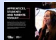
Apprentices, Students and Parents