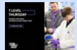
T Level Thursday